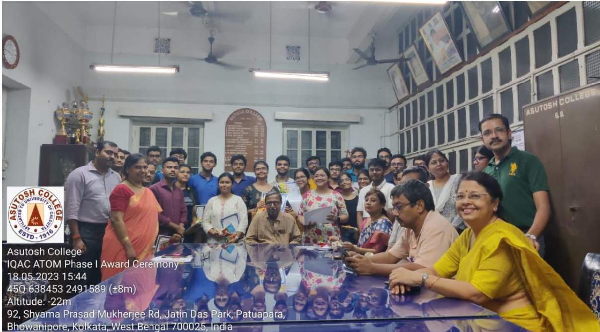
Asutosh College IQAC ATOM Phase I Award Ceremony 18.05.2023 15:44 45Q-638453 2491589 (±8m) Altitude: -22m 92, Shyama Prasad Mukherjee Rd, Jatin Das Park, Patuapara, Bhowanipore, Kolkata, West Bengal 700025, India

PROGRAMME ATOM MEANT FOR FELICITATING PASSED OUT STUDENTS FOR THEIR FEATS IN DIFFERENT EXAMS THUS FULFILLING THE MISSION OF INCLUSIVITY OF THE COLLEGE